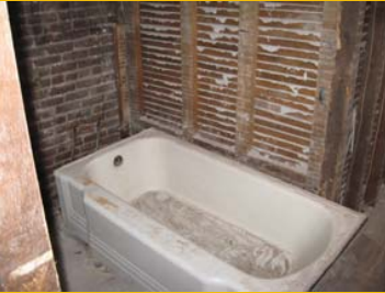
Bathroom Demo Salvaged Material