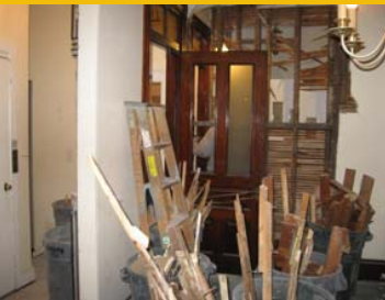
Demo of rectory wall for new layout