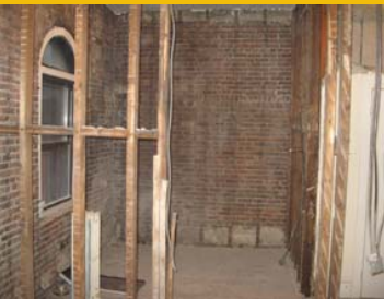
Demo of rectory wall for new layout